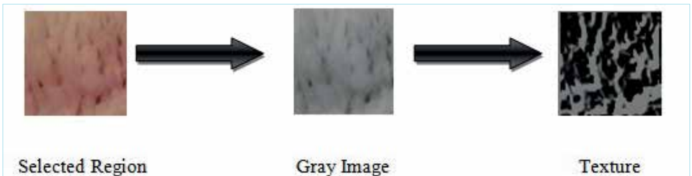
Figure 2. The image processing