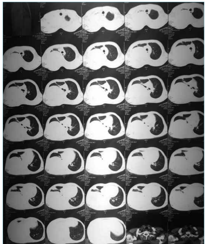
Figure 2. CECT thorax revealing right sided effusion with underlying lung collapse with mediastinal lymphadenopathy.