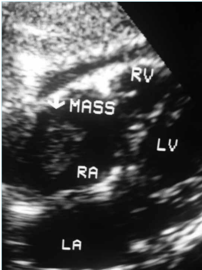
Figure 3. Echocardiography suggestive of a mass in right atrium extending from IVC likely to be a thrombus with dilated right sided chambers